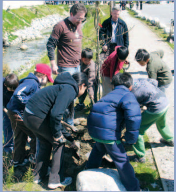
Trees improve habitat and reduce stormwater impacts, Still Creek, Vancouver.